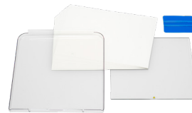
Advanced 3D printing kit Add a front enclosure, extra build plate and adhesion sheets