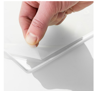
Adhesion sheets x25 For effective build plate adhesion